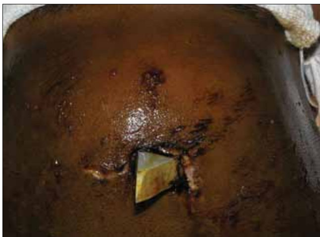
Figure 2: View from the top of the head