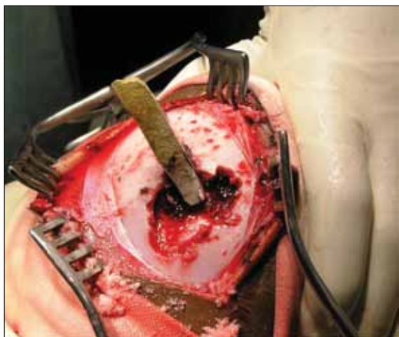
Figure 5: Intraoperative view showing the epidural hematoma around the FB

penetrated 1.5 cm deep to the inner table through a fracture of the skull in the midline [Figures 3 and 4]. We suspected penetration of the SSS. He was taken up for