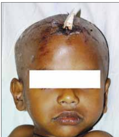
Figure 1: Tile fragment embedded in the skull