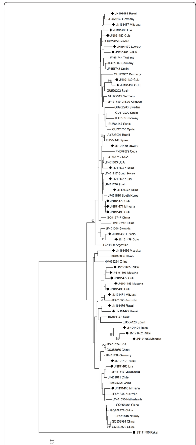
Figure 3 Phylogenetic analyses - TTSuV2 Phylogenetic analysis of TTSuV2 based on a 185 nt long sequence from the 5' UTR region, using Neighbour-joining algorithm and 1,000 bootstraps. Only bootstrap values above 70 are shown. The TTSuV2 sequences from this study are marked with ◆ and the one marked ■ is a TTSuV1 sequence from this study used as an outgroup. The district from where the samples from this study originated is indicated after the accession number.