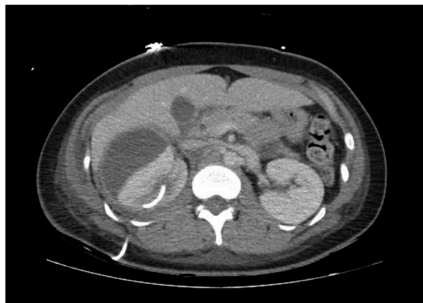
Figure 2. Repeat CT Abdomen with intravenous contrast showing growing perinephric collection (arrow) and resolved prior kidney cyst.

endocarditis. HIV testing was negative. CT abdomen/pelvis with contrast was repeated one week later, showing new right perinephric fluid collections (Figure 2). These collections were subsequently drained and found to be purulent as well. Cultures of the fluid grew P. bivia , which was confirmed with MALDI-TOF Mass Spectrometry. CT urogram was performed, showing no fistulous tracts between the genitourinary and gastrointestinal systems. Pelvic ultrasound revealed a complex ovarian cyst, but gynecological evaluation ruled this to be a benign, unrelated finding.