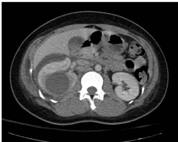
Figure 1. Renal cyst of 4.6 cm seen in right kidney (arrow), with perinephric fluid collection, also observed.

Per literature review, she was transitioned to intravenous ceftriaxone 2 g daily and metronidazole 500 mg every 8 h for the duration of her admission. Echocardiography revealed no cardiac vegetations and repeat blood cultures were negative, ruling out