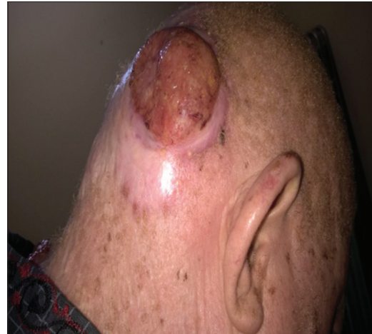
Figure 3: Basal cell carcinoma on the head