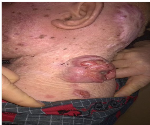
Figure 4: Malignant melanoma on the neck