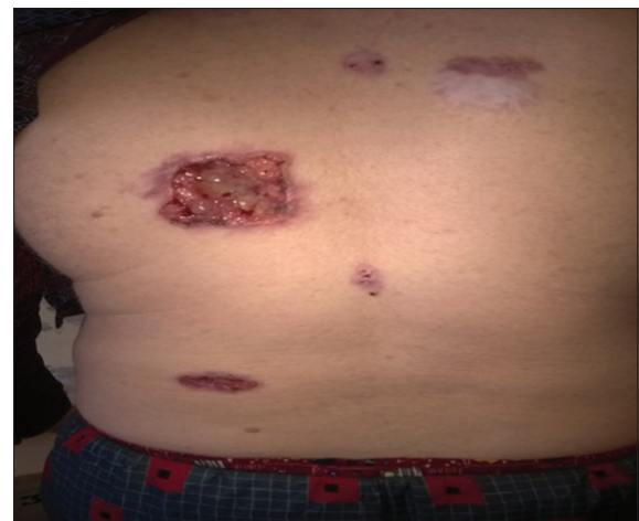
Figure 5: Squamous cell carcinoma on the lower back