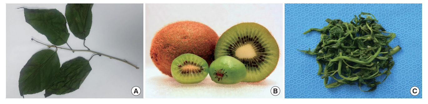
Fig. 1. (A) Actinidia arguta (hardy kiwi) vegetable. (B) The larger Actinidia deliciosa (green kiwi fruit) in back compared to the Actinidia arguta in front. (C) Boiled Actinidia arguta vegetable for oral provocation tests.