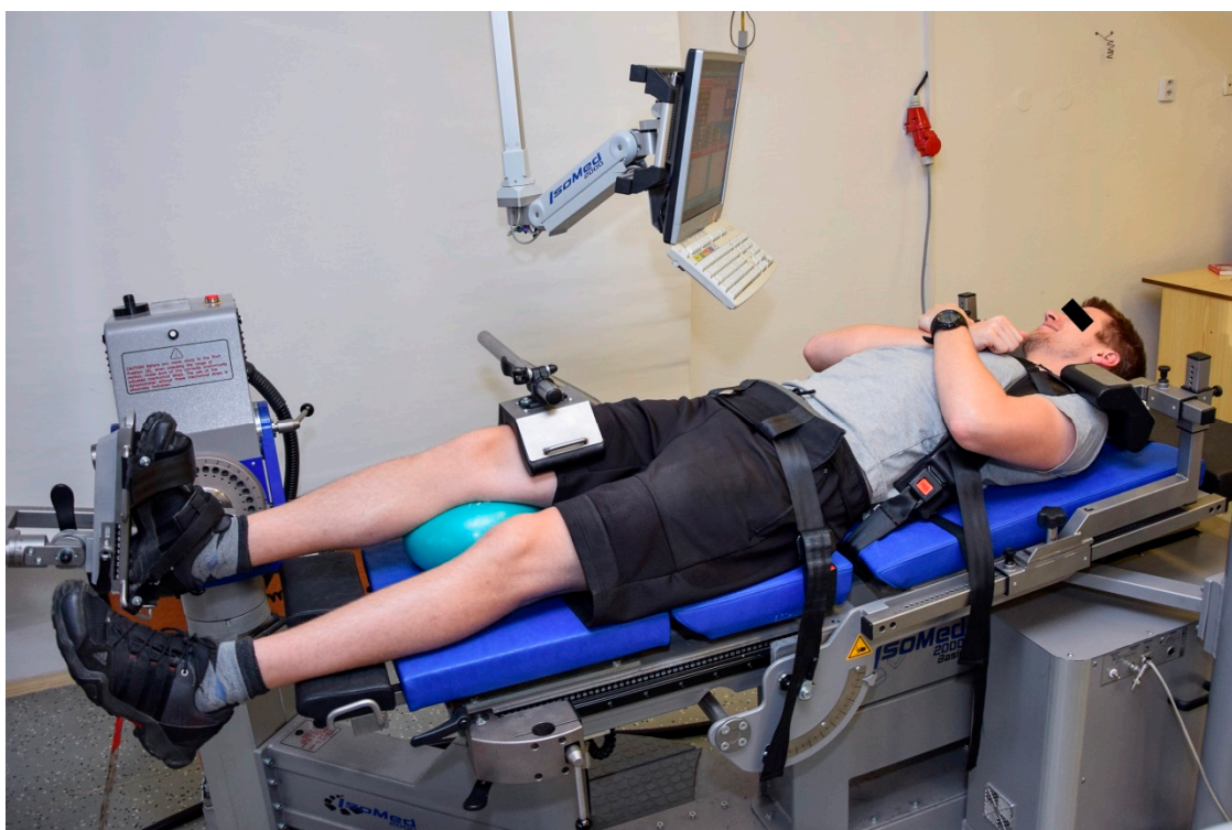
Figure 1. Positioning for the ankle plantar and dorsal flexors testing.

The participants laid supine on the dynamometer seat with their hips and knees in full extension. The foot was placed on the foot adapter connected to the head of a dynamometer and fixed with two Velcro straps. The axis of rotation of the lever arm was aligned with the axis of rotation of the lateral malleolus. The waist and thigh of the tested leg were fixed by straps, and an overball was placed underneath the knee of the tested leg to prevent overextension of the knee and for the subject's comfort. The shoulders were fixed in the ventral–dorsal and cranial–caudal direction by shoulder straps and pads. The participants were asked to cross their arms in front of the chest. After fixation, a static gravitational correction was applied to negate the influence of the gravity-effect torque on the test data. Figure 1 shows the testing position described above.