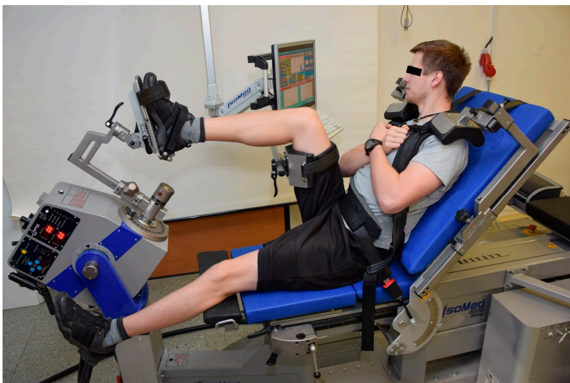
Figure 2. Positioning for the ankle invertors and evertors testing.

position were analogous to positioning for testing the ankle PF and DF, as described earlier. Figure 2 shows the testing position described above.