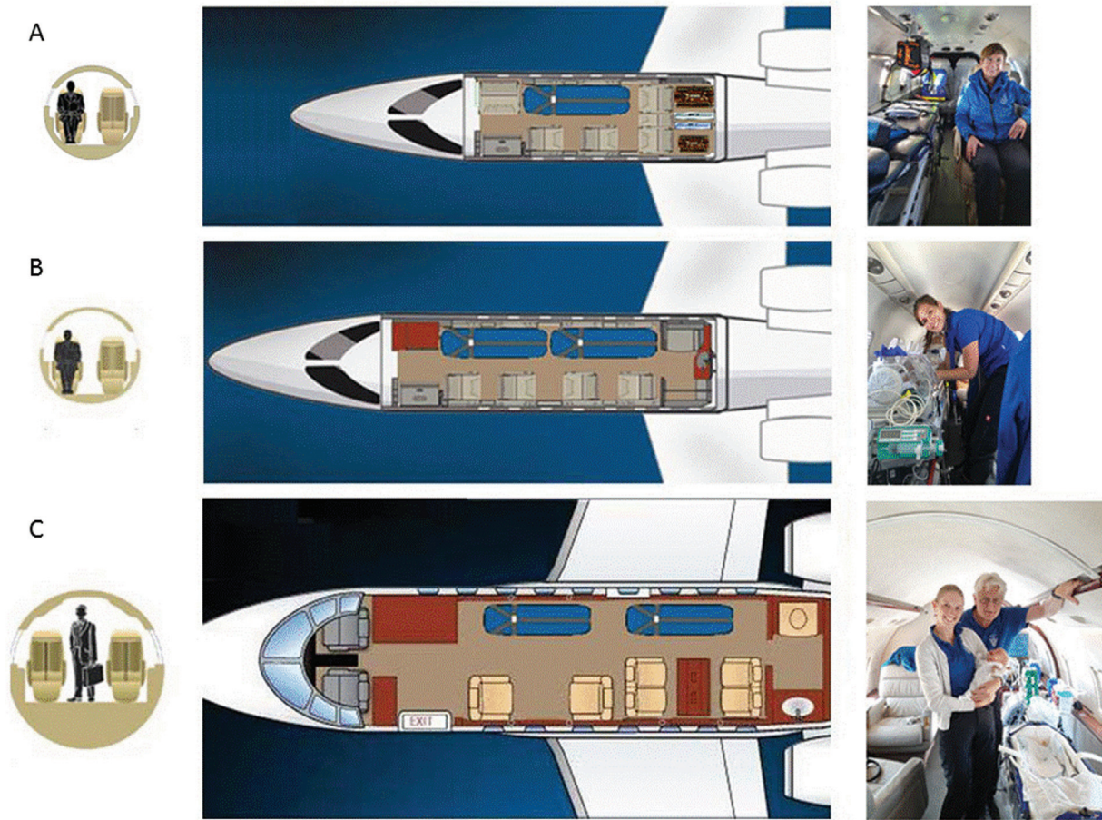
Fig. 1 Main aircraft types used in this study with cabin configuration, cross-sections, and interior layout. (A) Learjet 31A, (B) Learjet 45, (C) Bombardier Challenger 604.

born preterm compared with all other patients are shown in ►Table 2. Median NACA score was 3 (range = 1–5) median STEP score was 3 (range = 1–4).