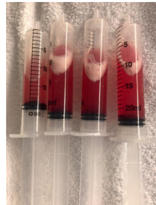
FIGURE 2: Progressively hemorrhagic aliquots.

criteria for DAH. These patients were compared with the 23 patients that did not satisfy the criteria for DAH. Low C4, decreased Hb, and hypoxia were statistically significant [9].