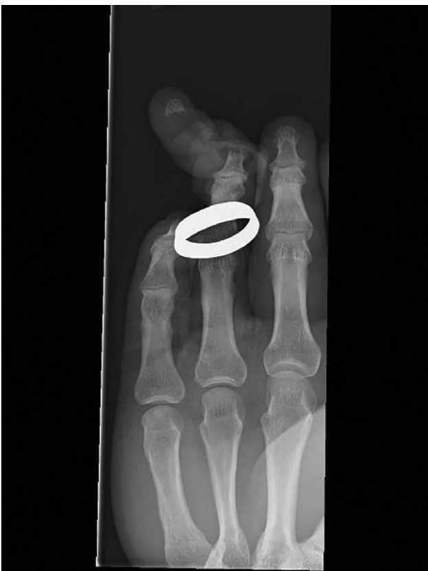
Fig. 2. Anterior posterior radiograph of ring avulsion revealing a distal tuft fracture.

As primary arterial repair is not always possible post-debridement (despite maximal proximal artery mobilization), reversed vein grafts or adjacent finger vessel transfers can be used to bridge gaps. Our preferred