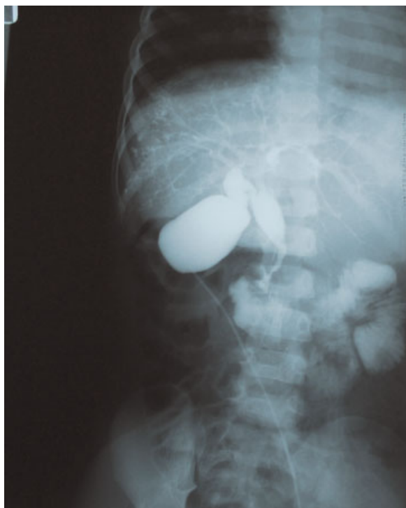
Fig. 1 Operative cholangiography shows pancreaticobiliary maljunction and a choledochal cyst.

(CT) showed hepatomegaly, dilation of intrahepatic bile ducts, and a polycystic kidney. Magnetic resonance cholangiopancreatography and drip infusion cholangiographic CT revealed PBM and a choledochal cyst. She had no variceal bleeding or jaundice. Viral markers of hepatitis A virus, hepatitis B virus, hepatitis C virus, cytomegalovirus, and Epstein–Barr virus were all negative. Her renal function was normal and renal biopsy was not performed. The parents were healthy, non-consanguineous Japanese. The patient had a healthy elder sister and younger brother, and her family had no liver or renal diseases.