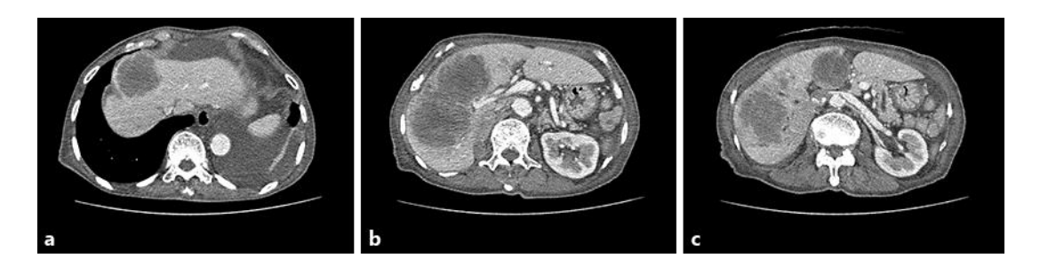
Fig. 1. a-c Abdominal CT findings before the initiation of chemotherapy. Multiple, relatively large, metastatic lesions are observed in a wide area of the liver. Left pleural effusion is also noted.