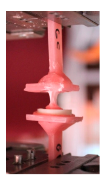
Figure 1. A sample during the test of the strength of the connection between the soft lining material and the acrylic resin.

on the samples, and they were driven manually in such a way that the acrylic plates were immersed in the self-curing acrylic and, at the same time, did not touch the samples. The samples were then removed from the jaws, the compression table was removed, and the lower stretching jaws were mounted. Specimens were fixed in the lower jaws, and in the upper jaws, another three acrylic plates were holders. The procedure for polymerizing the handles was repeated. After the acrylic had hardened, the samples were transferred to a water bath at 37 \pm 1 °C. Three aging times were used: 7 days \pm 1 h, 28 days \pm 2 h, and 90 days \pm 2 h. Ten samples were made for each compilation tested material. After removing them from the bath, the samples were clamped in the jaws of a testing machine and stretched at a speed of 10 mm/min until the sample was completely ruptured (Figure 1).