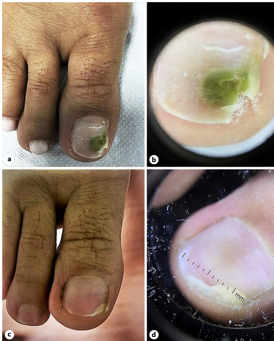
Fig. 2. a The patient presents a greenish pigmentation of the distal part of the toenail. b Onychoscopy of the right nail reveals a diffuse greenish pigmentation and onycholysis, suggestive for P. aeruginosa infection. c The patient presents a resolution of the distal pigmentation and improvement in onycholysis of the toenail. d Onychoscopy of the right nail reveals the complete resolution of the green pigmentation and a light onychomadesis with negative culture.

Ozenoxacin is approved in Europe to treat non-bullous impetigo in adults and children aged \geq 6 months [17]. It has excellent in vitro antibacterial activity against Gram-positive cocci, including QR strains with mutations in the QR determining region, being 3–321-fold more active than other quinolones [17, 18]. This strong in vitro activity of the new quinolones is probably based on improved affinity for the DNA gyrase and topoisomerase IV targets, creating more potent antibiotic and decreasing the in vitro selection of mutants and the emergence of spontaneous resistant mutants in clinical settings [19, 20]. In this view, we decided to use ozenoxacin in the treatment of our patients. To date, no data regarding the use of ozenoxacin have been reported against Gram-negative Pseudomonas spp. and Achromobacter spp. In our case, we have