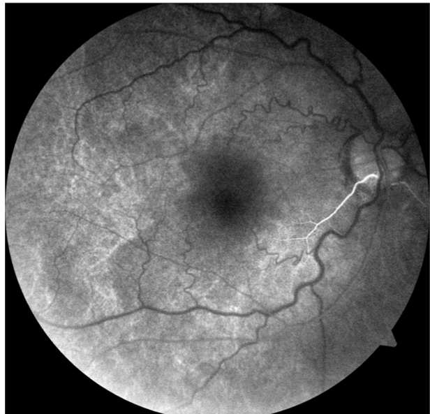
Figure 3 The cilioretinal artery begins to fluoresce at early phase angiogram (13.7 seconds).

normal. The visual field test using a 10-2 threshold Humphrey computerized automated perimeter was also normal.