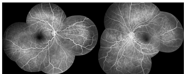
Figure 4 FFA photograph of both eyes showing obviously tortuous and dilated retinal veins.

The anomalous tortuosity and dilatation of the retinal vessel without other abnormality is rare, making the accurate estimation of incidence difficult. Gauss 2 estimated that the tortuosity of retinal arteries alone was twice as common as that of the veins. Walsh and Hoyt 3 and Awan, 4 however, hold an opposing view. In a retrospective analysis that evaluated