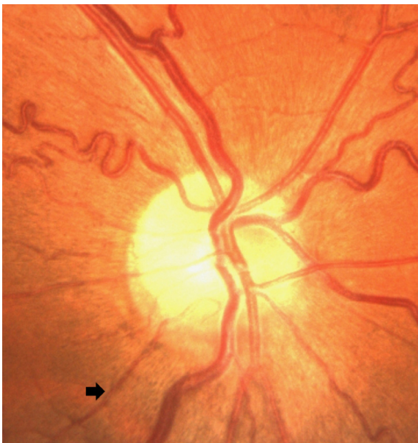
Figure 2 The cilioretinal artery course inferotemporally from behind the disc margin (arrow).

All the supplementary tests, such as contrast sensitivity, color test, Amsler grid, and electrophysiologic test, were