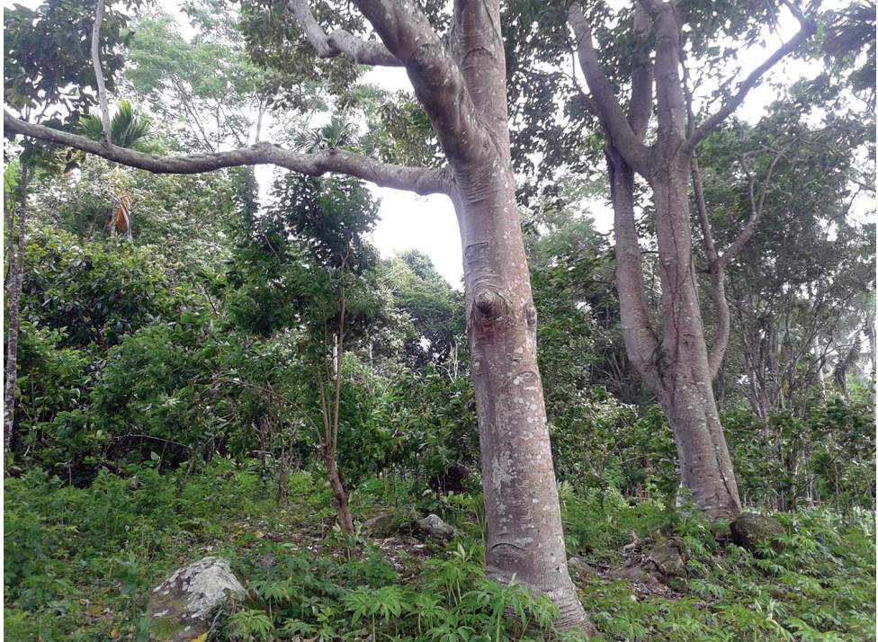
Figure 3. Type locality of Barsine podbolotskayae sp. n.: Flores Island, shore of Lake Sano Nggoang, secondary mountain forest with old nutmeg trees on a hill slope.

Remarks. Here we placed B. podbolotskayae sp. n. within the genus Barsine but its placement is in need of further investigation. Features of the costal margin of valva have so far not been found in any other known members of the genus (cf. Černý and Pinratana 2009; Holloway 2001; Bucsek 2012; Volyntkin and Černý 2017a, b, c, 2018), so that solely on these grounds B. podbolotskayae sp. n. might represent another genus. Nonetheless, we hesitate to erect a new genus for this species pending upon a thorough review of Barsine , Cyme and other closely related genera, whose systematic relationships are still largely unclear and need to be phylogenetically assessed (Holloway 2001; Volyntkin and Černý 2017c).