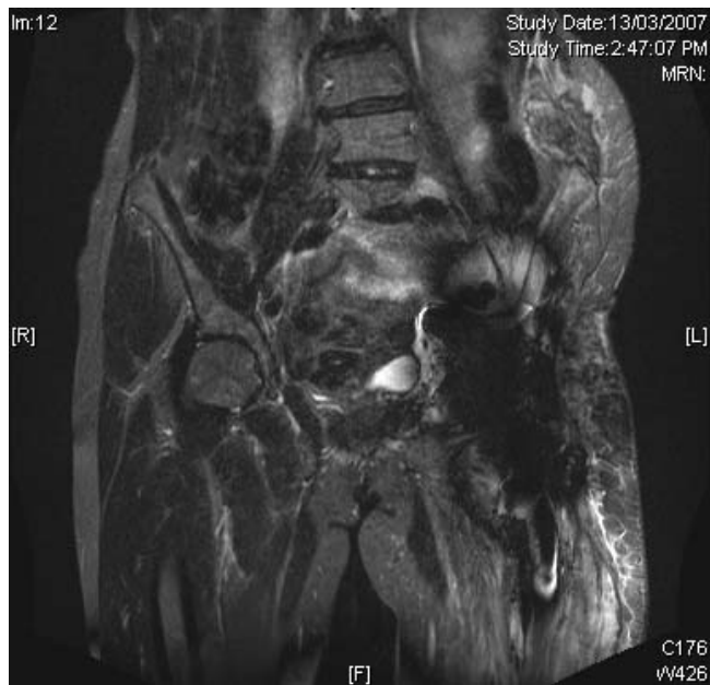
Figure 1 Pre-Operative MRI coronal view of Case Patient showing local cancer recurrence involving left pelvis and surrounding the saddle prosthesis.

From posterior, the medial origin of the gluteus maximus was elevated from the sacrum. An osteotomy was performed through sacrum from the greater sciatic notch laterally to approximately 1 cm medial to the sacroiliac joint. Ileo-lumbar, sacro-tuberal and sacro-spinal ligaments are divided. Under external rotation of the hemipelvis, the hemipelvis, tumour mass and femur were delivered en-bloc .