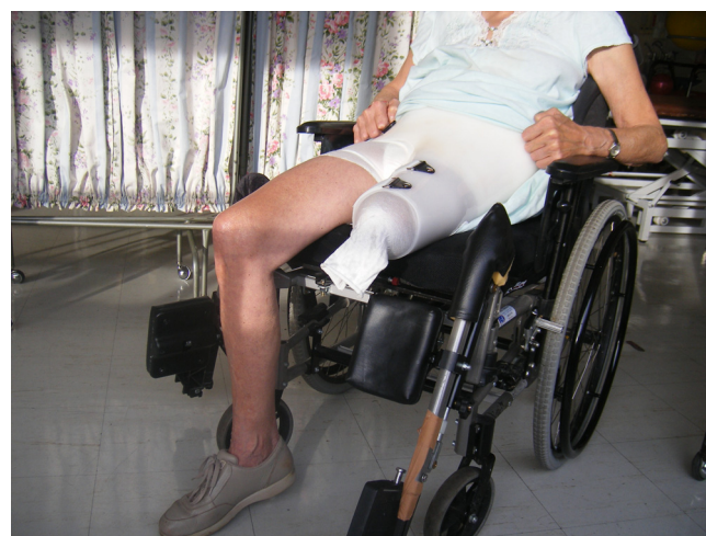
Figure 4 Clinical appearance of Case Patient 2 months following operation. Case Patient was able to sit upright comfortably with brace and was able to ambulate independently with crutches.

Wide resection remains an important principle in the treatment of bone and soft tissue sarcomas. Despite the fact that the majority of patients with pelvic sarcomas can be safely treated with chemotherapy and limb-salvage surgery, [2] in a number of patients external hemipelvectomy is still required to achieve wide margins. Techniques used for soft tissue coverage following external hemipelvectomy include the posterior flap and the anterior flap closure [3,4]. These techniques aim to achieve tissue coverage but is often associated with high morbidity and poor functional outcomes [5,6]. Post operatively the majority of patients are either unable to ambulate without the use of crutches (80%) or remaining wheelchair bound or bed bound (15%); only around 5% of patients are eventually able to ambulate with prosthesis [7]. Well-fitted prosthesis for post-external hemipelvectomy patients is difficult to produce and the energy requirement to ambulate with prosthesis is very high. For patients who had external hemipelvectomy even the ability to sit upright can be difficult without a well-fitted sitting socket because of the lack of an ischium. Psychological issues surrounding body image following external hemipelvectomy is also significant and requires extensive pre and pos operative counseling [8].