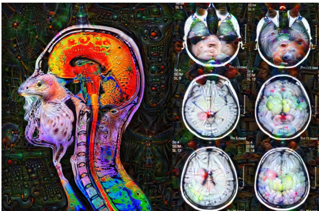
Figure 3. A Deep Dream AI generated images of MRI heads MRI heads were fed into the AI algorithm that produced outputs based on its own black box interpretation of the image. Developed using "Deep Dream Generator", https://deepdreamgenerator.com/ [accessed 25/10/2018]

In the future, AI is destined to become more powerful than the human mind, which may in turn, become the limiting factor. Doctors may no longer make diagnoses but will ensure that AI recommended diagnoses are relevant and meaningful to the patient. We will require truly "interpretable AI" that can converse with humans to explain its reasoning. 76 In fact, compared to its human counterpart, AI may become the more transparent intelligence—one that can be audited, interrogated and have knowledge gaps filled. 86 Pande describes the current "black box" as a feature rather than a drawback—allowing reflection on current thinking through observation of outcomes. An example of black box interpretation is expressed by Deep Dream generated images (see Figure 3). This black box may change the way radiologists currently think and decipher patterns in imaging. Furthermore,