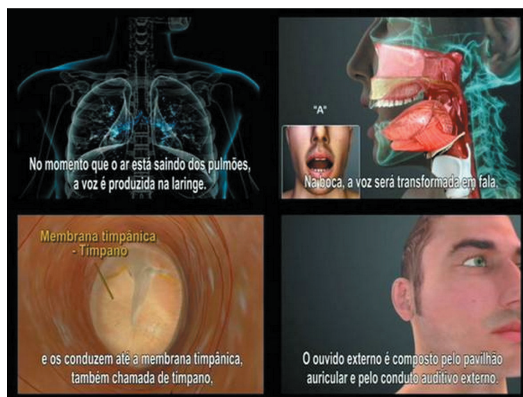
Figure 1- Study Object, CD-ROM Virtual Man Voice Assessment and Virtual Man Hearing Assessment

The Bauru School of Dentistry of the University of São Paulo (FOB-USP) pursued enabling the information technologies and the communication that allows the diagnose, the prevention and the treatment of diseases, beyond the education of the population and the health services by means of the "Tele-Health League of the FOB-USP" (TLFOB-USP) that is recognized as an Academic Extension Course,