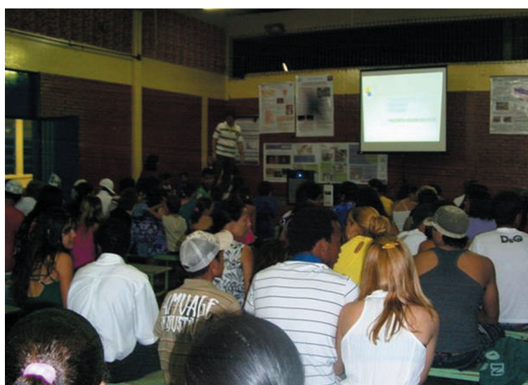
Figure 3- Production chain in health, knowledge and value hierarchy of the university to the community