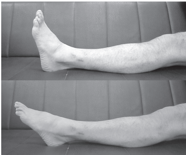
Fig. 2 Sample picture of the repetitive ankle plantar flexion test.

PN behind the fibular head. As the PN was strongly compressed by the fibrous band between the superficial head of the PLM and the SM, we dissected it distal to the peroneal tunnel. The PN was also strongly compressed by the PLM and we dissected its fascia and decompressed the PN distally due to retraction of the PLM (Fig. 3).