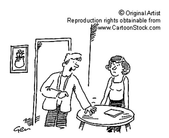
"The doctor said I might not be suffering from OCD after all, touch wood, touch wood, touch wood, touch wood...!"