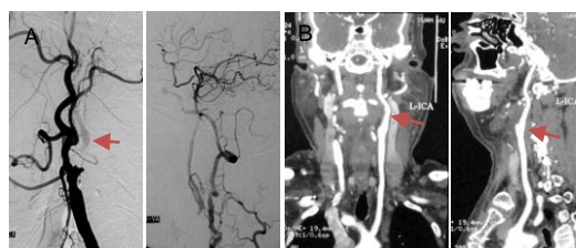
Figure 1 A 50-year-old male with paroxysmal right-sided limb weakness and dysphasia underwent carotid endarterectomy.

Carotid endarterectomy was performed in 51 patients and was unsuccessful in five patients. Hybrid surgery was performed in four patients and was unsuccessful in one patient. Carotid endarterectomy combined with Fogarty catheter embolectomy was performed in 10 patients and was unsuccessful in 1 patient. The success rate of treatment was 89% (58/65). Recanalization of the internal carotid artery in typical cases of carotid endarterectomy, carotid endarterectomy combined with thrombectomy, and hybrid surgery are shown in Figures 1–3.