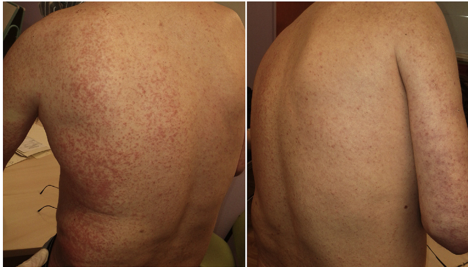
Fig 1. Maculopapular exanthema, left-sided.