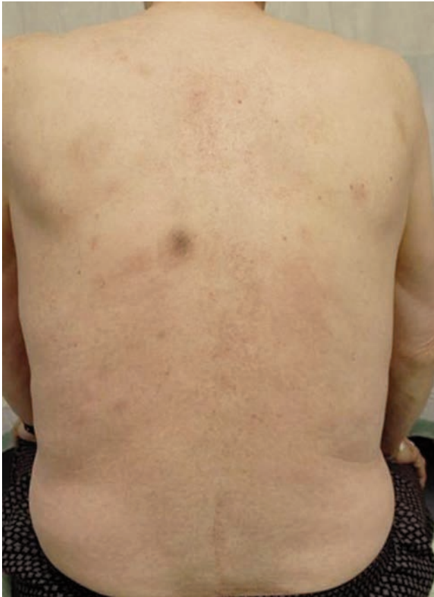
Figure 1. Bruise-like lesion on left side of thoracic vertebrae.