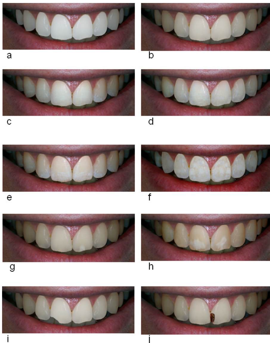
Figure 1 Images selected for study. Note how the images share a common base image with computer generated conditions stencilled over. 1a: very white teeth; 1b: teeth shade A1; 1c teeth with fluorosis TF1; 1 d: teeth with fluorosis TF2; 1e: teeth with fluorosis TF3; 1f: teeth with fluorosis TF4; 1 g: medium sized demarcated opacity on one tooth; 1 h: large demarcated opacities on both central incisors; 1i: teeth shade A1 with a chip on incisal edge of one tooth; 1j: teeth with carious lesion on one tooth.

The database was exported to SPSS for analysis. The mean ranks were calculated for each of the images and analysis performed to explore patterns in the data with