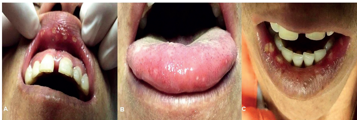
Fig. 2: Ulcerative stomatitis in a patient with arbovirus (CHIKV) infection. A: Multiple ulcers in the upper lip; B: Smaller ulcers with erythematous halo in tongue; C: Ulcerated areas covered by fibrinopurulent membrane in lower lip mucosa.

Variables were categorized in a dichotomic way to enable a bivariate analysis of the results. The bivariate analysis was performed through prevalence ratios and the chi-square test, with a significance level of 5%. The subjects with missing data for one or more variables were only excluded from the bivariate analysis of the respective missing variables.