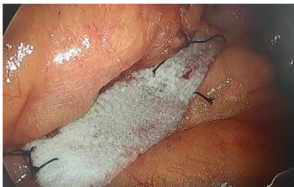
Fig. 1 View of Peterson's space after closure with BIO-A mesh with interrupted vicryl sutures

After introduction of the three ports, in most cases a liver retractor appeared unnecessary. First the pouch and gastro-enterotomy was examined and then the alimentary limb was measured, and length noted. Next, Peterson's space and the entero-enterostomy were examined after Treitz was located, then, the common channel was measured. When too much traction occurred on the small bowel, the ileocolic angle was looked up and from there the common channel was followed up till the entero-enterostomy. With this approach all internal hernias could be solved.