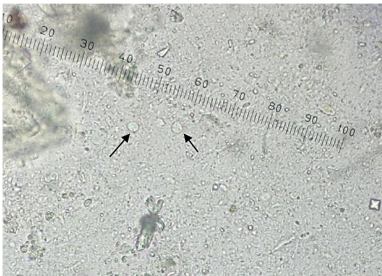
Fig. 2. Stool specimen, wet mount preparation (high-power field, 40× magnification). Note the presence of the multinucleated cyst of E. nana measuring 5–6 \mu\text{m} (arrows).