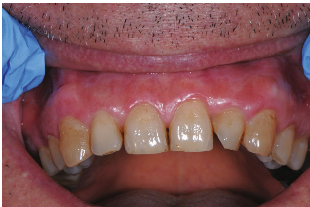
FIGURE 5: Six month after the end of treatment the mucous membranes of the lining appeared normo-chromic and normo-perfused in the absence of inflammation and symptoms.

The role that bacterial plaque plays in the etiology of the disease is not clear. Although the lesions often appear in anatomical areas compatible with plaque-induced gingivitis, patients generally do not have significant indices of periodontal inflammation, but a general condition of periodontitis is associated [1, 2, 4, 12].