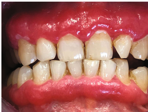
FIGURE 1: Intense edema and erythema localized to the adherent vestibular gingival mucosa, from elements 1.5 to 2.5.

During the collection of anamnestic data, the patient declared that he did not have allergies or voluptuous habits and that he was suffering from hypertension under treatment with nebivolol and diuretics. Following fillings of the teeth in 2016, he found erythematous hyperplastic gingivitis in the upper arch conditioning the feeding. He denied Raynaud's phenomenon, photosensitivity, lymph node swelling, weight loss, fever, xerostomia, and xerophthalmia. From the report of the specialist visit carried out by the rheumatologist, at blood tests he had isolated low anti-RNP antibody