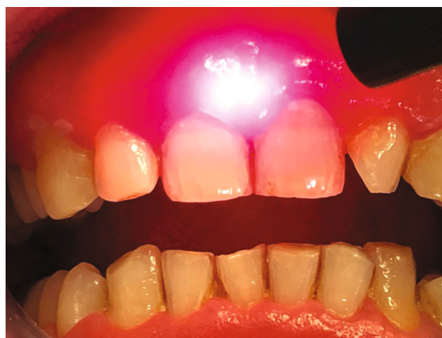
FIGURE 3: Intra-operative view, treatment performed with a diode laser, with a wavelength of 635 nm, 600- \mu m fiber, and a handpiece with 1 cm diameter lens. A power of 300 mW was used, with continuous emission mode and with application times not exceeding 1 minute/cm 2 (fluence 22 J/cm 2 ), carrying out grid-like scanning movements.

After informed consent signature, a PBM protocol associated with oral hygiene sessions and instructions for proper oral hygiene at home was planned. PBM treatments, which began in January 2018, were performed with a diode laser (SmartFile, Deka, Calenzano (FI), Italy) with a wavelength of 635 nm, 600- \mu m fiber, and a handpiece with a 1 cm diameter lens. A power of 300 mW was used, with continuous