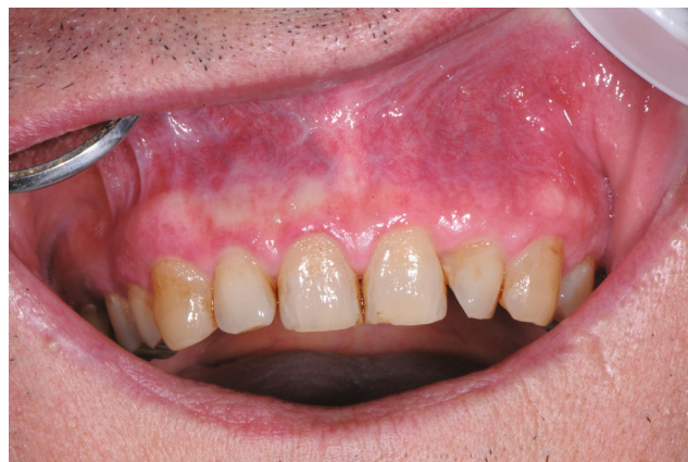
FIGURE 6: At the last check carried out in 2022, the patient's mucous membranes did not show signs of inflammation or recurrence of the original lesions.

In the illustrated case report, in the clinical evaluations, the parameters of symptomatic subjectivity of the patient were considered through the administration of the VAS and NRS scale, finding a progressive improvement of subjective symptoms. At histological examination, a substantial decrease in plasma cell inflammatory infiltrate in the peripheral context of the lamina propria was found after PBM treatment. To date, after five years of treatment, the patient presents healthy gingival tissue, without noteworthy recurrence of the lesion, with no need of topical steroid therapy.