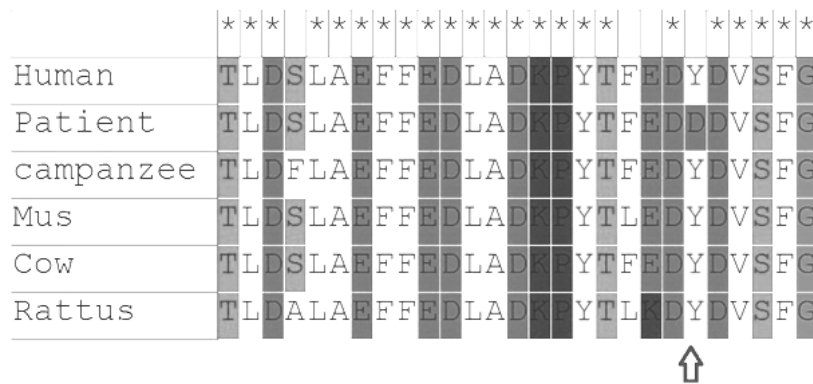
Fig 2. Sequence alignment of frataxin sequences from the human, chimpanzee, mouse, cow, and rattus for p.Y123D mutation in exon 3

In conclusion, point mutations in FRDA that causes an absence of functional frataxin, are associated with a severe phenotype. Our results showed that these point mutations in one allele and GAA extension in another allele are associated with FRDA signs. Thus, these results emphasize the importance of performing molecular genetic analysis for point mutations in FRDA patients.