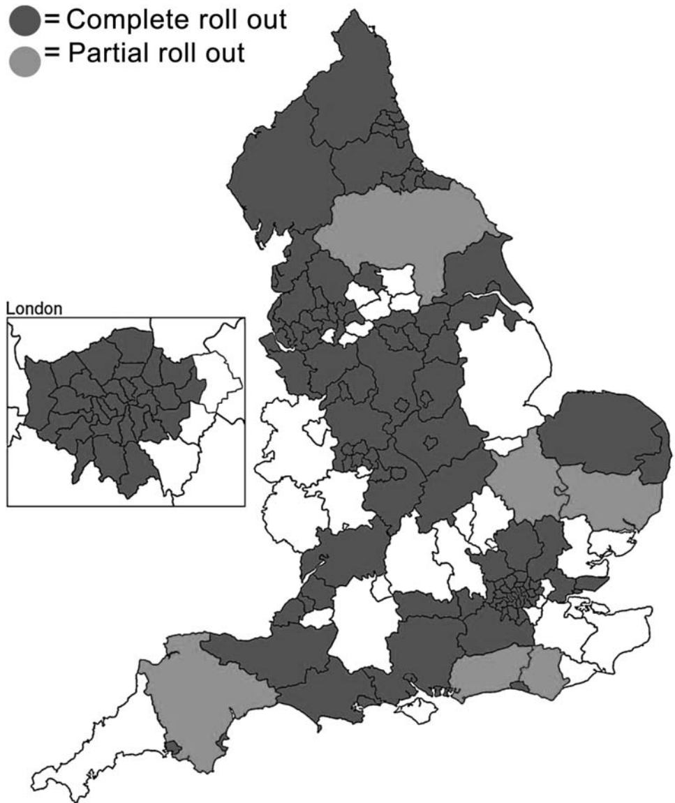
Figure 3 Extent of roll out of Bowel Cancer Screening Programme by primary care trusts in October 2008.

than women (1.5%) ( \chi^2=1445 , p<0.00001 ). This difference was of similar magnitude across all areas.