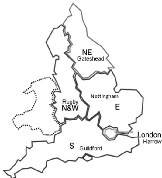
Figure 1 Areas of England covered by five regional Bowel Cancer Screening Programme hubs.

Patients are given the results of colonoscopy by the SSP before they leave the department. Where nothing abnormal has been found, the patient is discharged from that round of screening and informed that they will be invited again for screening in 2 years' time (provided that they are still within the eligible age range). Where one or more polyps have been removed, the patient is offered an appointment at an SSP follow-up clinic in the next week. Adenoma surveillance is based on the current British Society of Gastroenterology (BSG) guidelines. 13 If patients with adenomas are categorised as intermediate or high risk, they enter the screening surveillance programme. This surveillance programme is part of the BCSP and surveillance colonoscopies are scheduled and performed by the screening centre. Such patients are sent no further invitations to take part in further FOB testing rounds until they leave surveillance. If patients with adenomas are categorised as low risk, they do not enter the screening surveillance programme, but are discharged from that round of screening and informed that they will be invited again for screening in 2 years' time (provided that they are still within the eligible age range). If a cancer is found, the patient's care is taken over by the hospital's multidisciplinary team for the management of colorectal cancer.