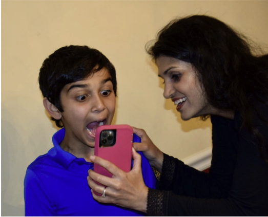
Fig. 1. Caregiver facilitating child oral examination over virtual video visit for evaluation of possible OSA.

related movement disorders, such as restless legs syndrome. During an initial visit for delayed sleep-wake phase disorder, caregivers and the child often are able to articulate a thorough history, for which a comprehensive plan beginning with light therapy, possible melatonin use, possible chronotherapy recommendations, and behavior therapy can be developed. Virtual visits for insomnia often are discussion-heavy visits or medication follow-ups,