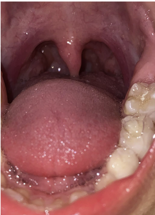
Fig. 2. Oral airway examination photo taken by parent sent by email to clinician.

related movement disorders, such as restless legs syndrome. During an initial visit for delayed sleep-wake phase disorder, caregivers and the child often are able to articulate a thorough history, for which a comprehensive plan beginning with light therapy, possible melatonin use, possible chronotherapy recommendations, and behavior therapy can be developed. Virtual visits for insomnia often are discussion-heavy visits or medication follow-ups,