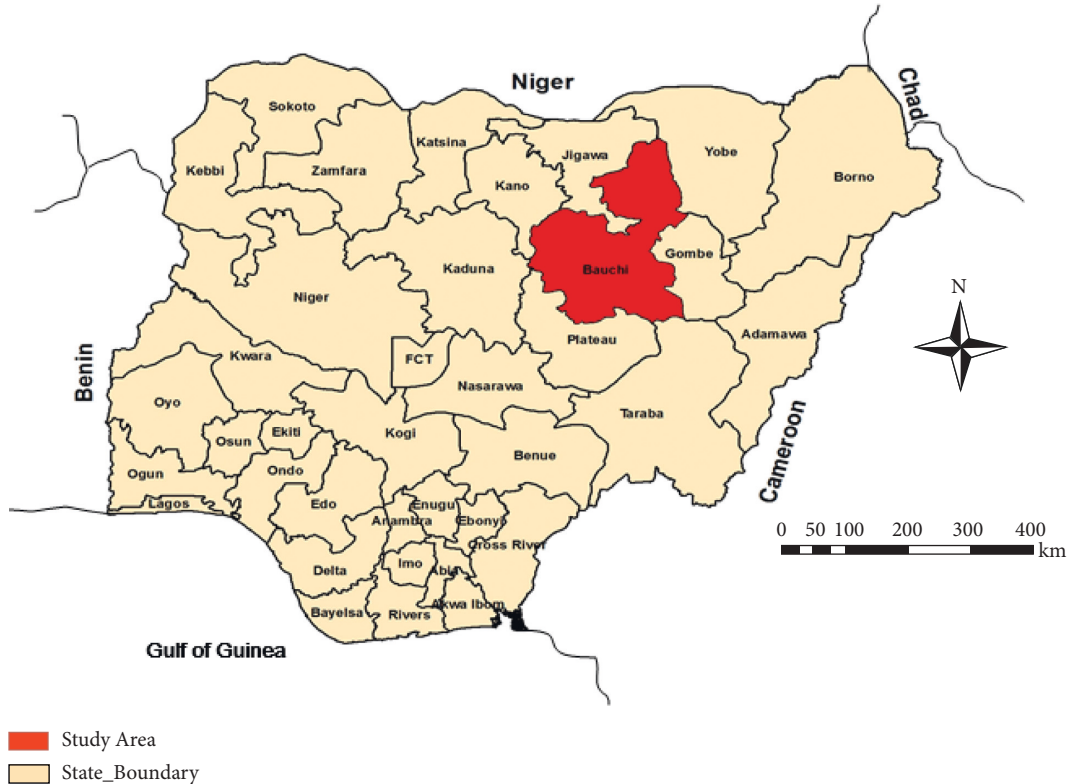
FIGURE 1: Map of Nigeria showing Bauchi state.

domestic and wild animals were evaluated using the ID screen® RVF competition multispecies ELISA kits (ID-Vet Innovative Diagnostics, Montpellier, France). The cELISA is based on recombinant nucleoprotein and detects anti-RVF virus IgG antibody. Briefly, 50 ul each of ELISA buffer and test sera were added to each well containing the RVFV antigen-coated test plates. Positive and negative control sera were added to the designated wells of each test plate and were incubated for 45 min at 37°C. The plates were emptied and washed three times with 300 ul of wash solutions, and 100 ml of the diluted conjugate was added to all the plates and incubated for 30 min at 21°C. The plates were then emptied and washed 3 times with 300 ul washing solution, and 100 ul of the substrate solution was dispensed to all the wells and were incubated for 15 min at 21°C in the dark. Thereafter, 100 ul of stop solution was added to all the wells. Readings were taken using a spectrophotometer Multiskan® ELISA reader (Thermo Scientific, USA), and the optical density (OD) was determined at 450 nm. The positivity of each sample was determined by calculating its competition percentage (CP). Samples with CP = ≤40% were considered positive for RVFV antibodies and those with CP = >50% were declared negative for RVFV antibodies.