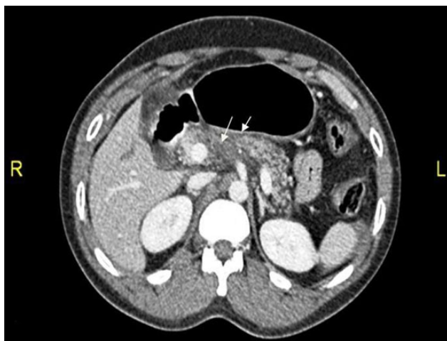
Figure 1: CT abdomen showing two hepatic lacerations in addition to minimal subhepatic and left subdiaphragmatic free fluid.