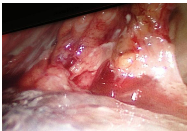
Figure 2: The intraoperative extension of the pancreatic necrosis that involves the entire gland.

Preoperative endoscopic retrograde cholangiopancreatography (ERCP) and magnetic resonance cholangiopancreatography (MRCP) were not performed at this stage. Exploratory laparoscopy showed moderate amount of free fluid (serosanguinous). Cytology and culture from the fluid revealed no organism growth; however, its pancreatic amylase level was 6062 U/l. Severe pancreatic reaction with saponification was seen over the thickened and contused greater omentum and bowel loops. A thorough exploration revealed no associated intra-abdominal injuries. During exploration of the lesser sac, pancreas was found to be hemorrhagic and necrotic, and the ductal injury could not be identified. Figure 2 shows the intraoperative extension of the pancreatic necrosis that involved the entire gland. Thorough lavage of the lesser sac and peritoneal cavity were done. Two drains were inserted into the lesser sac and pelvis following which the procedure was terminated without conversion.