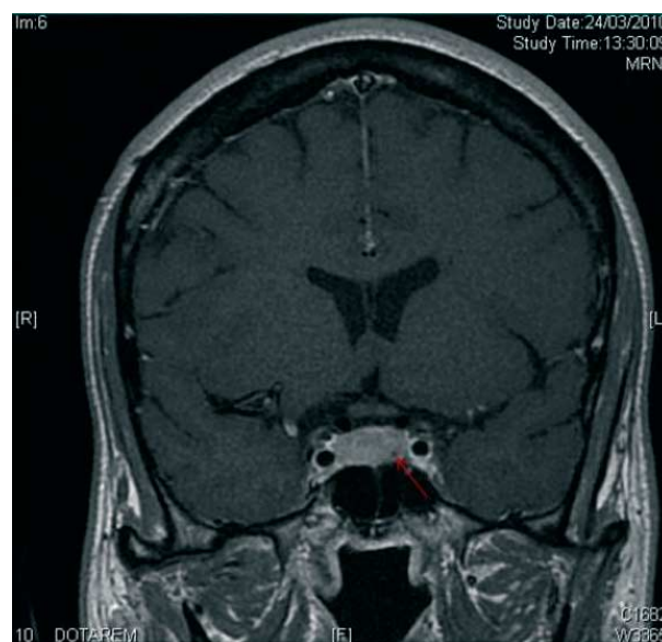
Figure 2 Coronal T1-weighted postcontrast MRI of pituitary showing enlarged pituitary with a small microadenoma or cyst (indicated by arrow).

Postoperative biochemical testing demonstrated normalisation of plasma normetanephrine to 0.6 nmol/l (<1.09) and metanephrine to 0.35 nmol/l (<0.46). During a repeat GH suppression test, GH levels suppressed normally