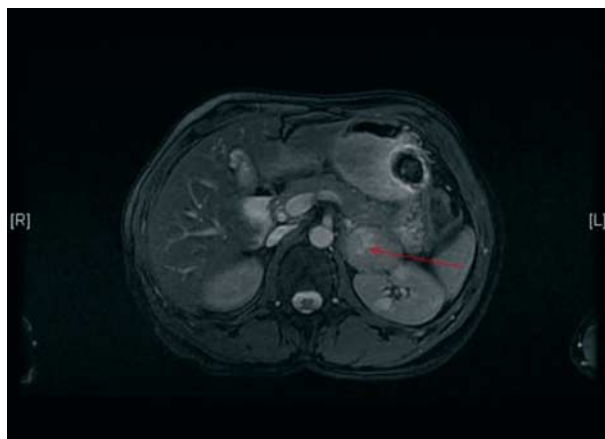
Figure 1 Sagittal T2-weighted MRI of abdomen showing left adrenal mass. (indicated by arrow)