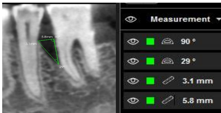
Fig. 1. Pre-treatment measurement of defect depth, width and angle