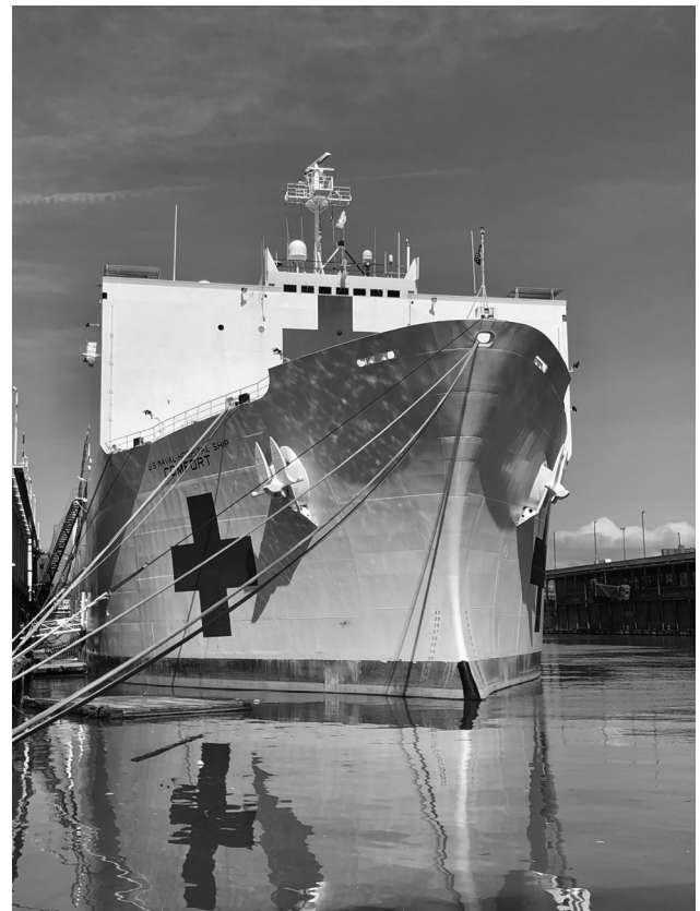
FIGURE 1. USNS Comfort Docked Pier side upon arrival in New York City.

Extensive craniofacial reconstruction has been an important capability of Comfort as was seen during Operation Unified Response in January 2010. 8 In this mission to Haiti, following a devastating 7.0 magnitude earthquake, 35 patients underwent 95 craniofacial surgical procedures by the craniofacial service. Despite the unpredictable challenges intrinsic to a natural disaster response in a low-income country, the surgical team achieved remarkable outcomes in these cases. 8