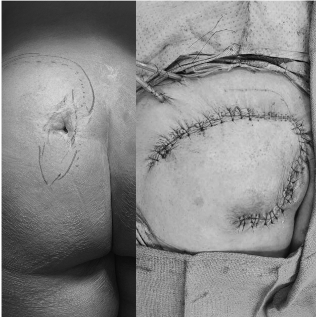
FIGURE 2. Pre- and Post-operative appearance of patient with sacral osteomyelitis requiring rotational flap.

Aboard Comfort was a full complement of surgeons consisting of orthopedic, vascular, general, oral-maxillofacial, cardiothoracic, neurosurgery, and an otolaryngologist—neuroplastic surgeon. Of the 52 surgical cases performed on board, 2 cases required collaboration between the neurosurgeon and neuroplastic surgeon and included a patient with sacral osteomyelitis and cutaneous fistula requiring local flap closure, and a cranioplasty.