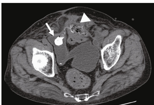
FIGURE 2: Abdominal computed tomography (CT) scan on arrival: the mesh migrated into the neobladder (arrow) and the small intestine (arrowhead).

neobladder fistula caused by the mesh migration, and conservative treatment with antibiotics (TAZ/PIPC) was started. However, this conservative treatment did not improve the patient's condition, and he was referred to our hospital one month later. A fistula was found on the skin of the lower abdomen (Figure 1). Urine drainage from the fistula was also observed. Urinalysis was positive for occult blood and bacterial contamination, and the urine culture showed enteric bacteria. Hematological examination revealed a white blood cell count of 8530/\mu\text{L} , which was within the normal range, but C-reactive protein was elevated at 3.81\text{ mg/dL} . Cystography showed the neobladder without fistula formation, and cystoscopy showed fecal matter and calcified mesh in the bladder. Abdominal CT scan showed a migrated mesh into the neobladder and ileum (Figure 2). The patient was therefore diagnosed with mesh migration into the neobladder and ileum with entero-neobladder and entero-cutaneous fistulas related to mesh infection. Mesh removal and partial resection of the neobladder and small intestine were performed (Figures 3(a) and 3(b)). The mesh was tightly adherent to the neobladder and ileum, with fistula formation. The mesh was completely removed, and the neobladder and ileum were partially resected. The defect in the neobladder wall was closed in a straightforward manner, and the resected