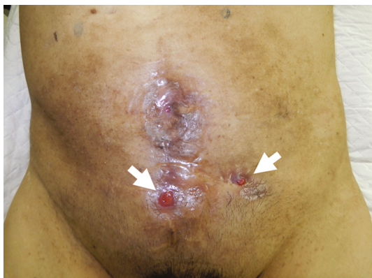
FIGURE 1: Abdominal finding. Cutaneous fistulas are seen in the mid and left lower abdomen (arrows).