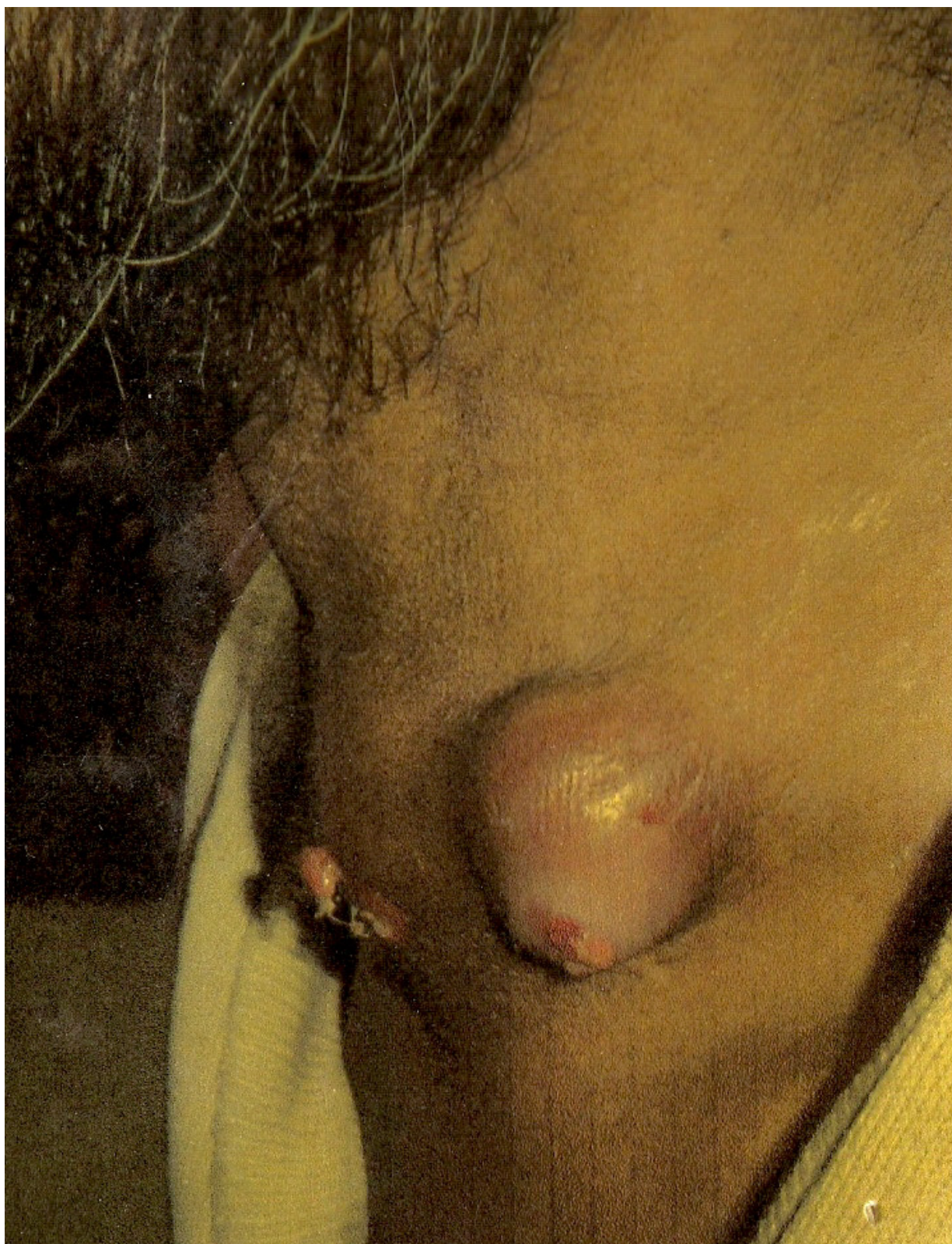
Figure 5 Case 3: Clinical picture showing the recurrent growth, the scar of old surgery is also visible.