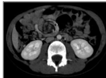
Figure 1: Twisted mesenteric vessels seen on CECT scan (Whirlpool sign)

tery widened. Approximately 40 cm distal to the duodeno-jejunal flexure, a 10cm x 5cm tubular jejunal duplication on the mesenteric side was found (Fig. 2). It communicated with the normal jejunum through a narrow opening.