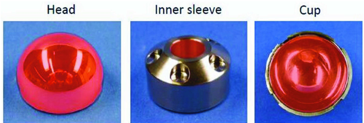
Fig 1. The red marked bearing and taper surfaces in the picture bellow were analysed.

The mean Harris Hip Score was 'fair' ( 70 > 80 ). Patients revised because of pain scored a lower HHS ( 60 > 70 ) compared to the other revisions. Seven patients (77.8%) experienced pain in the