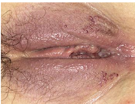
Fig. 3. Clinical appearance after final laser treatments. No recurrence has occurred after 2 years, but follow-up is continuing.