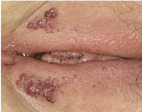
Fig. 1. Clinical appearance at initial presentation. Grouped vesicular lesions are visible on the vulva, showing a typical 'frog spawn' appearance.

Sasaki et al.: Successful Treatment of Congenital Lymphangioma Circumscriptum of the Vulva with CO 2 and Long-Pulsed Nd:YAG Lasers