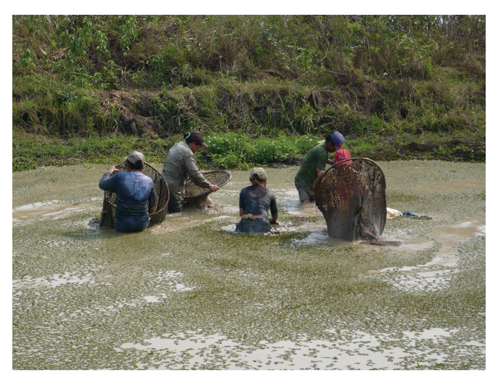
Figure 2. Fishing with cotton nets in an artificial pond. Baures, Bolivia.

from the Baures region, Bolivia. In the extensive floodplain savannas of this region, Erickson (2000) identified kilometers of zigzag lines built of the earth (1 to 2 m wide and 20 to 50 cm tall). At the end of the savanna's flood period, these would help to block and direct the water. These structures were interpreted as fish weirs. More recently, Blatrix et al. (2018) have shown that these earth structures are spatially associated with artificial ponds.