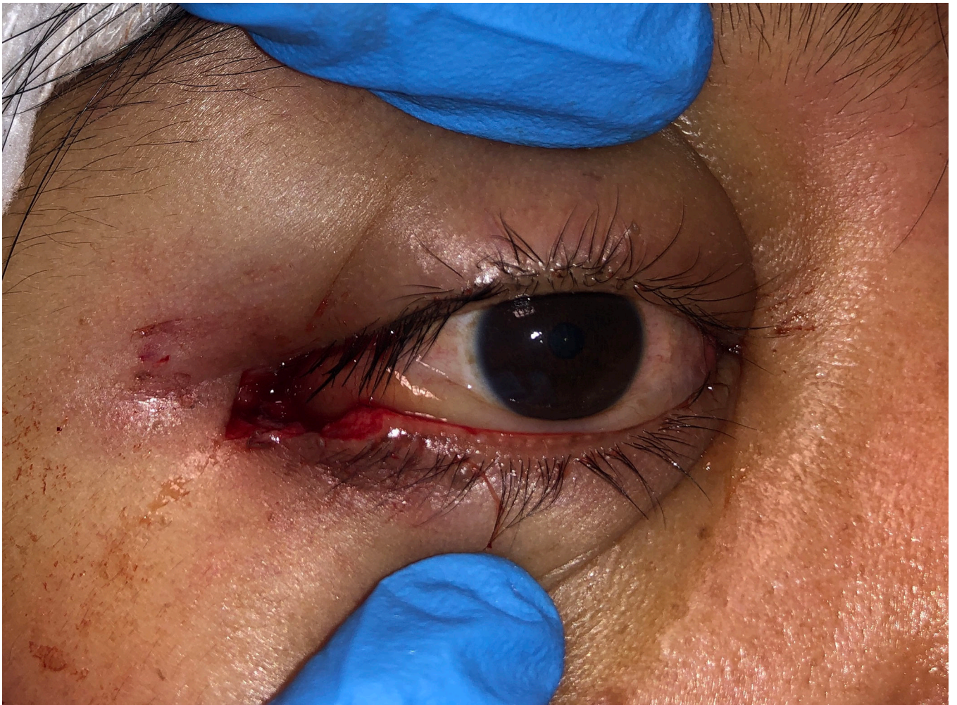
Figure 2: External photography of the patient's right eye after canthotomy and inferior cantholysis, demonstrating periorbital swelling, proptosis, and ophthalmoplegia