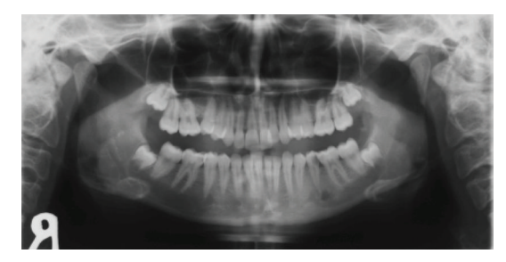
FIGURE 3: Orthopantomographic image showing a deep caries cavity in the left mandibular second premolar tooth and a radiolucent area in its apical region.

the resulting bone mass is similar in both shape and volume. Yet, fibrous dysplasia is distinguished from Garre's osteomyelitis due to the "ground glass appearance" as well as the thinning seen in the cortex. Further, unlike Garre's osteomyelitis, it is not associated with any dental infection. In addition, the enlargement is seen in the internal structure of the bone in fibrous dysplasia, whereas the enlargement of the bone in Garre's osteomyelitis is seen on the outer surface of the cortex, while the presence of the original cortex can be detected within the enlarged portion of the jaw in a careful examination [1, 4, 6, 10].