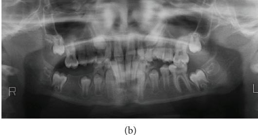
FIGURE 1: Orthopantomographic image showing a deep caries cavity in the right mandibular first molar tooth, a radiolucent area in its mesial root, and subperiosteal new bone formation below the lower border of the mandible (a). Orthopantomographic image taken four months after tooth extraction showing the return of normal bone contours (b).