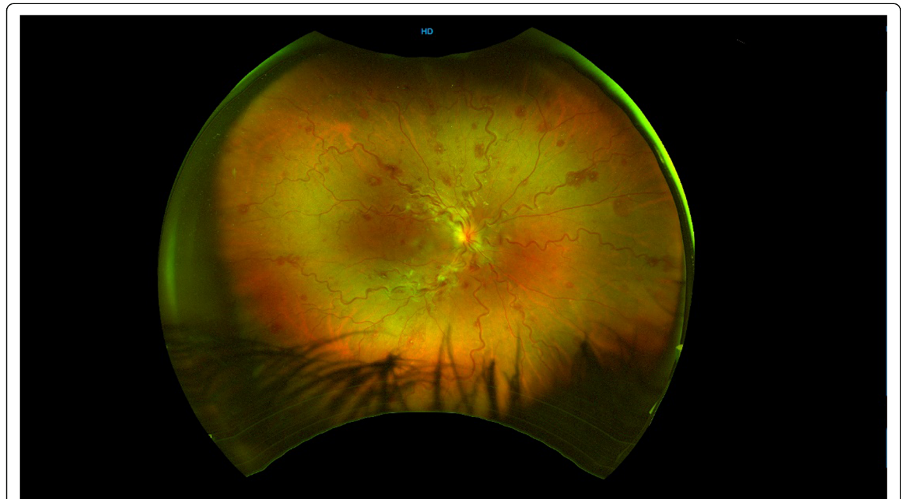
Fig. 1 Colour fundus photograph showing tortuosity of vessels, dot and blot haemorrhages, cotton wool spots and optic disc swelling

The profound anaemic status and iron-deficiency was largely attributed to the lack of iron intake through her