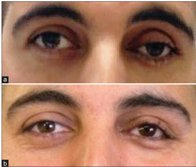
Figure 3: Clinical photograph of a 35-YO patient before (a) and after (b) secondary orbital sphere ceramic 22 mm implant. Note the post enucleation socket syndrome (PESS) appearance before surgery with enophthalmos, ptosis and deep superior eyelid sulcus. Post operatively (b), there is symmetric fullness of both upper eyelids and improved left upper eyelid position

In this study, we focused on the main anatomical features and functional properties that are related to a favorable cosmetic result. These properties originate from the socket anatomy, surgical procedures and healing process. Specific decisions during the early stages of management and surgery affect these properties, whether the surgeon decides to insert an implant of a specific size, reattach the extraocular muscles and spare as much conjunctiva as possible, can all affect the prosthesis physical characteristics and the final cosmetic result. In larger sockets, or when an implant is not inserted, bulkier prostheses may be needed, which would affect their motility, stability and eyelid closure. Further studies are needed to explore the impact of these factors on the specific anatomical features and functional properties, as well as on the general cosmetic result. Any correlations between clinical findings and the final cosmetic outcome would be of great importance to treating physicians when choosing treatment strategies in such patients.