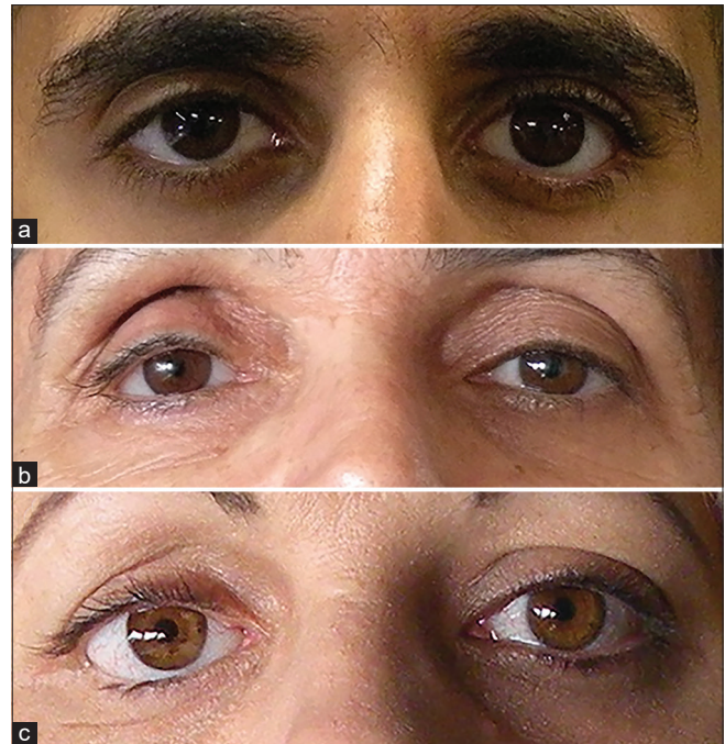
Figure 1: Clinical photos of three anophthalmic patients demonstrating variable cosmetic results. (a) A 32 year-old male with left ocular prosthesis and a good cosmetic result; symmetric eyelid opening and orbital volume. (b) A 61 year-old woman with a right deep superior eyelid sulcus deformity secondary to lack of orbital implant. (c) A 49 year-old woman post severe right orbital trauma and multiple reconstructions, demonstrating eyelid asymmetry secondary to lower eyelid retraction and relative enophthalmos

A total of 107 anophthalmic patients (50.1% females) completed the patient self-assessment questionnaire and