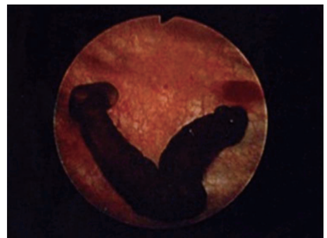
Fig. 3. Calcified Hem-o-lok clip identified during cystoscopy.

BNC has been encountered less frequently in the era of RARP (Table 5). Improved visual magnification and dexterity of robotic instruments have contributed to the observed difference [2,4]. Both surgical techniques and patient-related factors have been evaluated in contributing to development of BNC. Traditionally described risk factors include prior radiation,