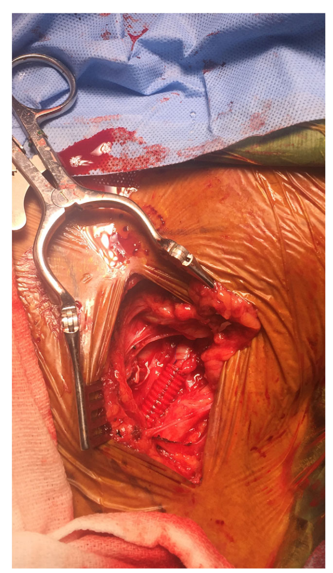
Figure 4: Reconstruction of subclavian artery with Dacron graft.

We have presented aTOS on a 65-year-old male. Although case reports of aTOS are numerous in various databases, we