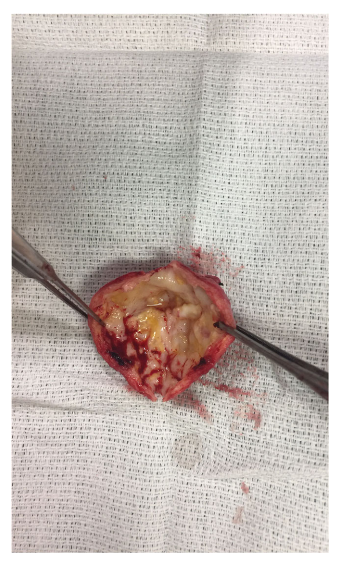
Figure 3: Resected portion of aneurysm inspected for mural thrombus.

Physical examination is important and includes several provocative manouvers. Upper limb tension test and abducting the arms to 90° in external rotation usually brings on symptoms. Cervical plain radiography should be performed first to assess for bony abnormalities and to narrow the differential diagnosis. CTA or MR imaging performed in association with postural manouvers is helpful in analyzing dynamic compression. Color duplex (US) is good supplementary tool for assessment of vessel compression in association with postural manouvers. Arteriography is the gold standard, however, not necessary. Most would advocate for arteriography to assist with planning arterial reconstruction [5].