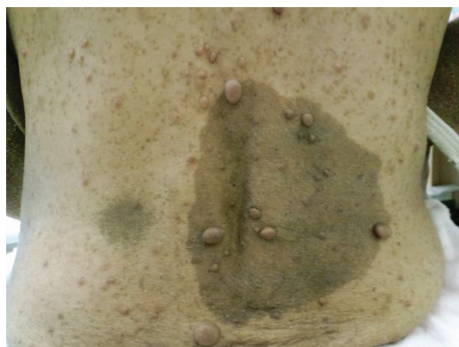
FIGURE 1: Patient with multiple cutaneous neurofibromatosis and café au lait macules.

vascular resistance (PVR) of 476 \text{ dyne}\cdot\text{s}\cdot\text{cm}^{-5} . Cardiac output (CO) was 4.0 \text{ L}/\text{min} and the cardiac index was 2.9 \text{ L}/\text{min}/\text{m}^2 . High-resolution computed tomography (HRCT) showed markedly enlarged central pulmonary arteries, upper-lobe centrilobular emphysema with multiple bullae, and bilateral ground-glass nodules with multiple cystic lesions in the lower lobe (Figure 2). A ^{99\text{m}}\text{Tc} macroaggregated albumin lung perfusion scan showed perfusion defects of bilateral upper lobes, and these defects matched emphysematous lesions of her lung. An obstructive pattern was observed in a respiratory functional test as follows: forced expiratory volume in 1 s, 1.86 \text{ L} (83% of predicted); forced vital capacity 2.88 (105.5% of predicted); and diffusion capacity of lung for carbon monoxide 3.6 \text{ ml}/\text{min}/\text{mmHg} (23.9% of predicted). The results of the tests for rheumatoid factor, antinuclear antibody, anti-scleroderma antibody, anti-smith antibody, anti-ribonucleoprotein antibody, and anti-Sjogren's syndrome A/Sjogren's syndrome B antibodies were all negative. The patient denied any history of diet drug use, human immunodeficiency virus risk factors, obstructive sleep apnea symptoms, or rheumatological symptoms.