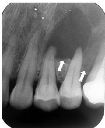
Fig. 3: A periapical radiograph of a central mucoepidermoid carcinoma shows ill-defined radiolucent area at the left posterior maxillary region. Inferior border of the lesion is indicated by arrows. The superior and posterior borders of the lesion cannot be revealed on this periapical radiograph.

logically rendered as non-endodontic periapical lesions. The frequencies of non-endodontic periapical cases in our study were higher than those of previous studies, reporting from 0.64 to 4.22% of periapical radiolucent lesions as shown in Table 3 (1-3,5-7). The male to female ratio in our study was 1.3:1. The slight male predilection of our study is consistent with those of Huang et al. (1) and Kontogiannis et al. (5) but in contrast to other studies (2,3,7) in which females were predominant. The frequencies of cases occurring in the maxilla compared with those in the mandible did not differ much. Approximately 52% of non-endodontic lesions occurred at the maxilla and 48% occurred at the mandible.